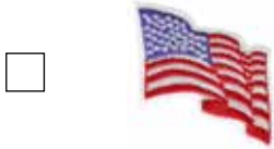
American Flag Patch Made in USA. 14302 $2.75