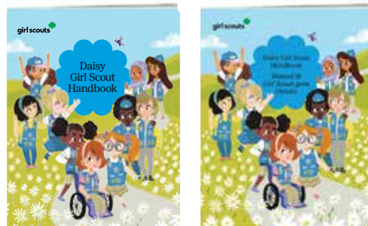
Daisy Girl Scout Handbook 20374 Bilingual Daisy Girl Scout Handbook 20555 $20.00