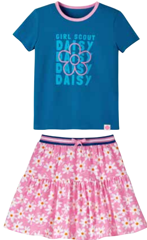
Outline T-Shirt Floral Skort

Make it Official! Pair your uniform with Daisy Official Apparel