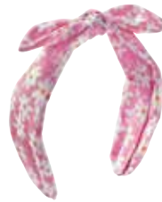
Daisy Print Bow Headband ABS plastic (50%), polyester (45%) and cotton (5%). 40030 $10.00