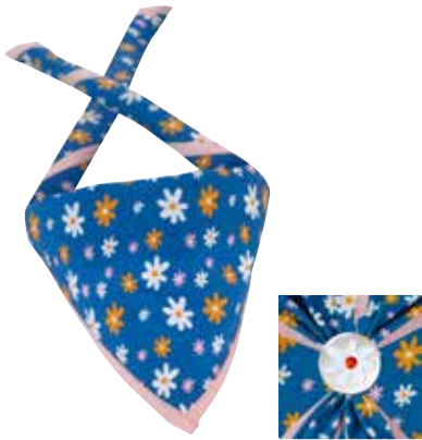
Official Daisy Scarf Recycled cotton. 03760 $15.00