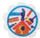
Craft and Tinker