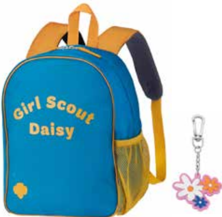
Daisy Backpack Recycled polyester (55%) and polyester (45%). 11043 $34.00