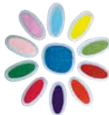
Daisy Petals* Imported 09079 $10.00

Troop Year Plans Click Here to learn more.