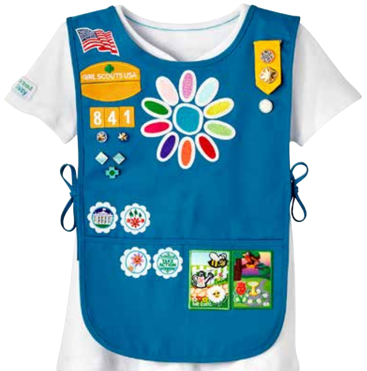
Official Daisy Uniform Tunic Certified Repreve® recycled polyester (40%), polyester (40%) and cotton (20%). Made in USA. Girls' Sizes: XXS/XS/S, M/L. Girls' Plus Sizes: M/L. 0367 $23.00