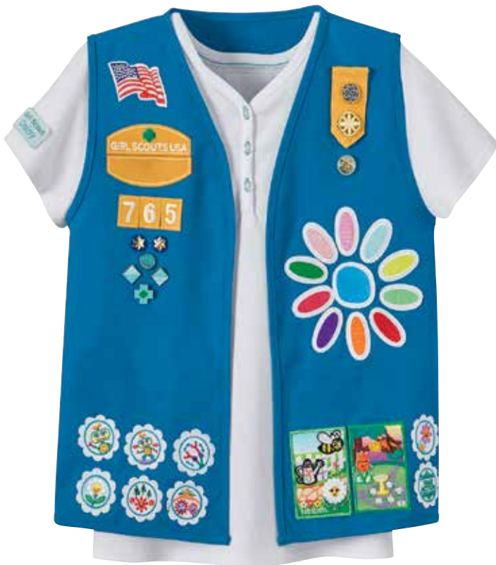
Official Daisy Uniform Vest Certified Repreve® recycled polyester (40%), polyester (40%) and cotton (20%). Made in USA. Girls' Sizes: XXS, XS, S, M, L. Girls' Plus Sizes: PS, PM, PL. 0368 $23.00

Your uniform tells a story. Make your mark one badge, pin and award at a time! Double check your vest or tunic with our Insignia Checklist — or use our customization service to order your new uniform, complete with core insignia. Complete your uniform with our Official Uniform Apparel options. Ready for your next chapter? Your journey starts here!