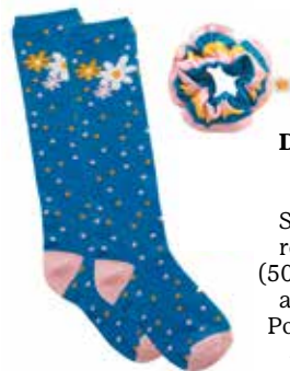
Daisy Knee-High Socks and Scrunchie Set Socks are made of recycled polyester (50%), polyester (47%) and spandex (3%). Polyester scrunchie. Sizes: S/M, M/L. 1129 $16.00