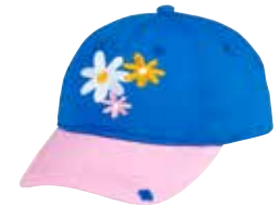
Official Daisy Baseball Hat Cotton (80%) and recycled polyester (20%) woven twill. 03740 $18.50