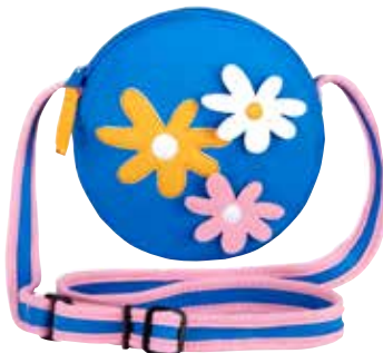
Daisy Trio Crossbody Bag Biodegradable foam. 11712 $28.00