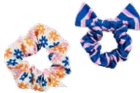
Daisy Scrunchies Set Printed polyester. 40031 $10.00