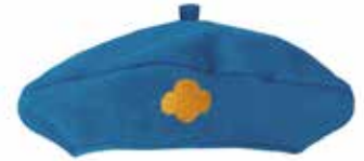
Official Daisy Beret Recycled polyester felt. 03953 $24.00