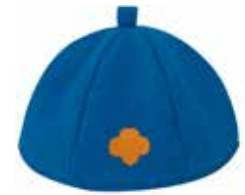
Official Daisy Beanie Recycled polyester felt. Girls' Sizes: M, L. 0375 $11.00