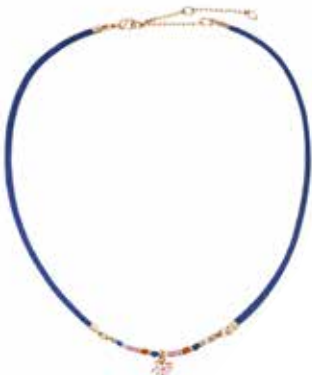
Daisy Bead Necklace and Earrings Set Necklace: 50% acrylic, 20% zinc alloy, 10% faux suede, 10% brass, 5% epoxy, and 5% steel. Earrings: 80% zinc alloy, 14% epoxy, and 6% surgical steel. 12971 $12.00