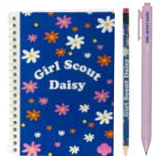
Daisy Stationery Decal 35425 $2.00 Journal 35424 $12.00 Pencil 35422 $1.25 Pen 35423 $4.00